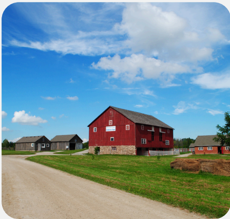
Bronte Creek Provincial Park